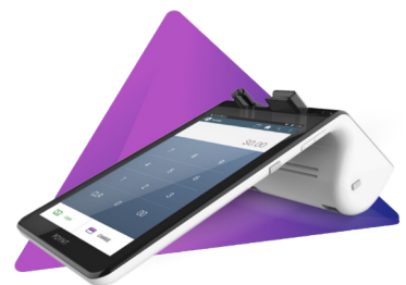
POYNT TERMINAL World's first smart terminal