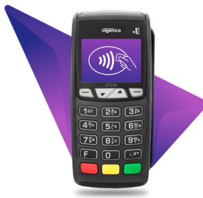
INGENICO ICT250 Colour desktop