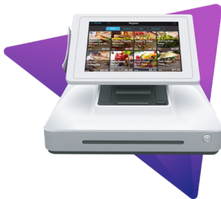
TALECH POS Restaurant & Retail solution