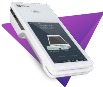
CLOVER FLEX POS All-in-one wireless smart POS

Ask for advice and complete a cost analysis to get informed.