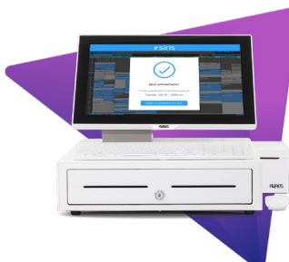
SIRIS POS Scheduling + product solution